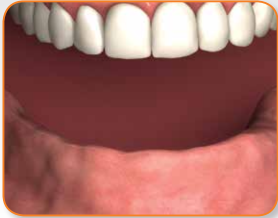
typical patient with missing teeth